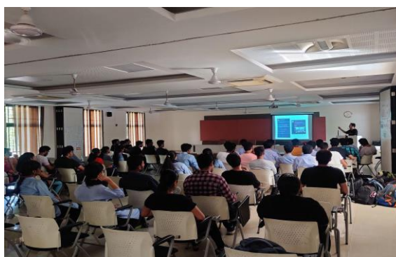
Participants attending the mentorship Session on Artificial Intelligence, Machine Learning and Data Science