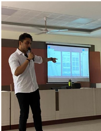
Workshop presentation by expert