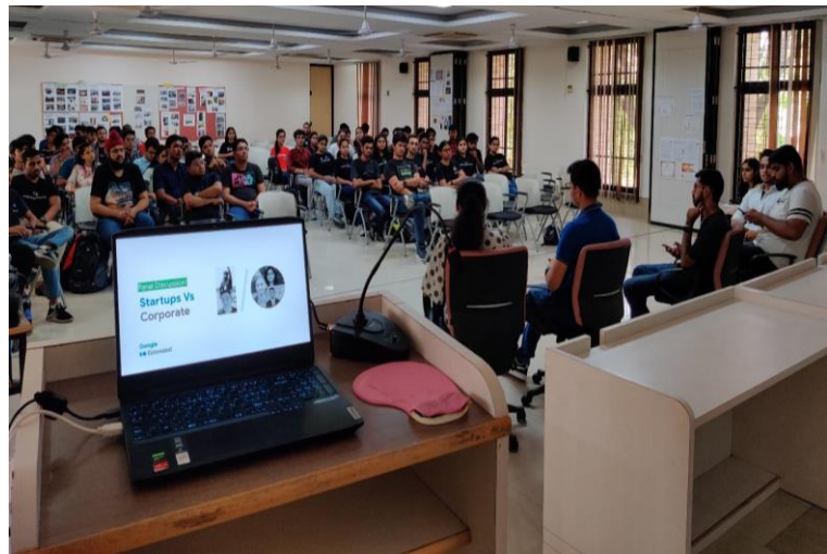
Panel discussion in session-2