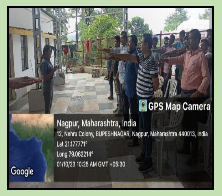
The Principal, NSS Program Officer, other faculties and students taking the pledge of Swaccha Bharat

The primary objective of the SWACHHANJALI Cleanliness Drive was to instill a sense of responsibility and awareness among the students and the community towards maintaining a clean and green environment. This initiative aimed to contribute to Swachhata Hi Seva (SHS) campaign.