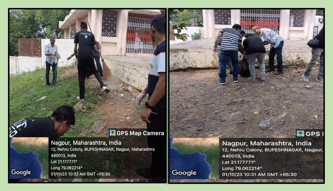
Principal, RCOEM, other faculty members and students working at the drive with the students